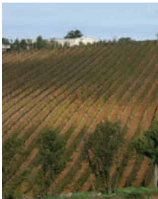
The Monteti hillside