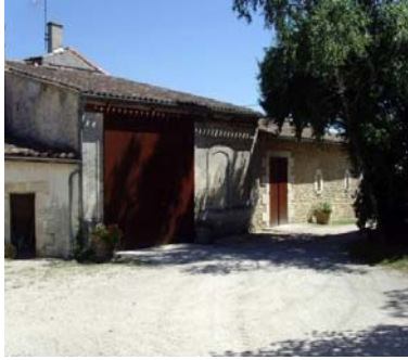
The Unimposing Chateau Micalet