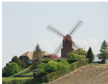
Windmill overlooking the town of Verzenay