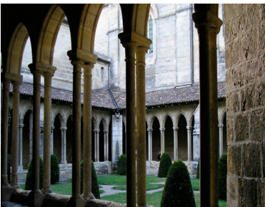
Courtyard in the midst of Chateau Faure