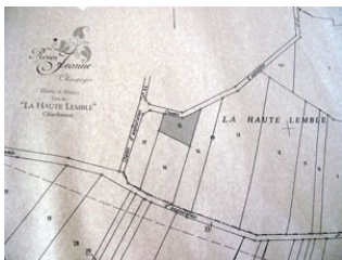
Vineyard map that is occasionally wrapped around a bottle of Roses de Jeanne. In this case it's the layout of La Haute-Lemblée