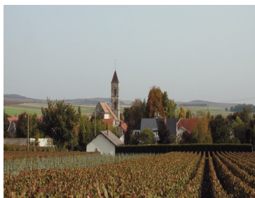
View of Ambonnay