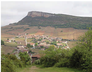
The Rock of Vergisson