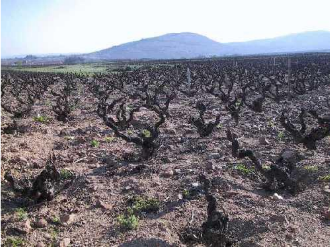
Mont Brouilly from Regnié