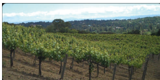
Spring Ridge Vineyard