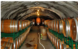
One of the caves built by Adam Grimm in 1889