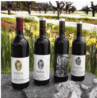
Cabernet Sauvignon and the three Zinfandels