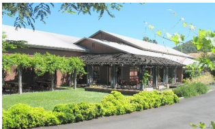
The Tasting Room